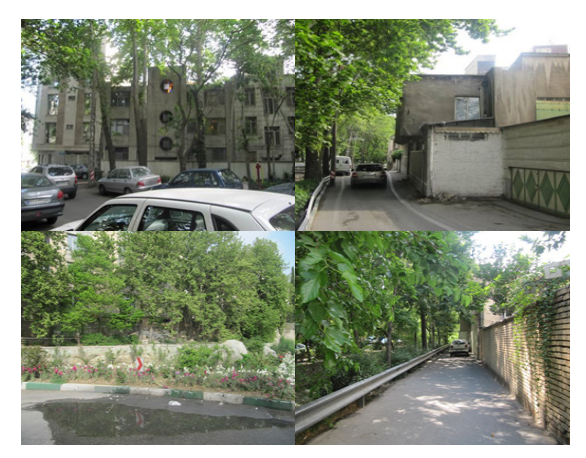
Fig. 4: samples of texture walls (edge) (in different arenas)

In conditions of urban edges importance played by these walls in texture, they maintain their initial state which is deduced from local architecture and Urbanism or change to other types of qualities due to newer construction (Fig.4).