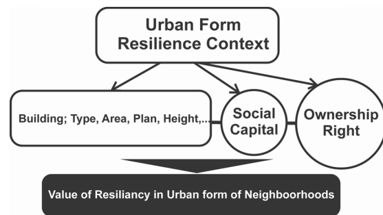
Fig 2: Conceptual Model of Research Evaluation of the Gradualization of the Urban Form of the Neighborhood in the Historical Context

ing the resilience approach in urban form, physical dimensions In criteria such as density and structure of morphology, social, in the criteria of social credit and the to work, urban environment, vitality and transportation, and ultimately economic, with the criterion of ownership and degree of use of land, and the diversity of residence and property value are explained and The concept of the urban form after the intersection with burnout practically has the greatest impact from two physical dimensions And socially acceptable. It should be noted that the historical concept is either in the worsening of the burnout, or in a non-existent one, the only concept that gives the most attention to the history of the building and the type of spatial organization of its value, and only one emphasis on the type of evaluation and variables of the model. Is. (figure 2)