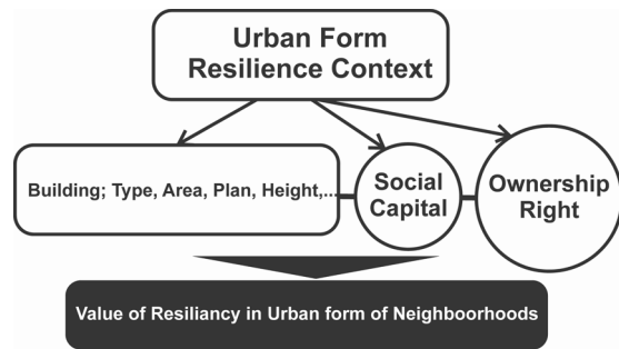
Fig 2: Conceptual Model of Research Evaluation of the Gradualization of the Urban Form of the Neighborhood in the Historical Context

ing the resilience approach in urban form, physical dimensions In criteria such as density and structure of morphology, social, in the criteria of social credit and the to work, urban environment, vitality and transportation, and ultimately economic, with the criterion of ownership and degree of use of land, and the diversity of residence and property value are explained and The concept of the urban form after the intersection with burnout practically has the greatest impact from two physical dimensions And socially acceptable. It should be noted that the historical concept is either in the worsening of the burnout, or in a non-existent one, the only concept that gives the most attention to the history of the building and the type of spatial organization of its value, and only one emphasis on the type of evaluation and variables of the model. Is. (figure 2)