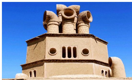
Figure 1 (Left): Sticky windbreaker in Sirjan city, Kerman Figure 2(Right): Summer residence of the Borujerdiha house, Kashan