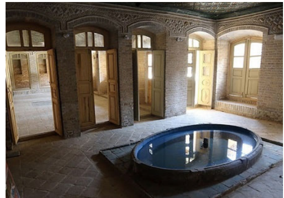
Figure 7(Left): Hoozkhaneh in Ttraditional house of Darooghe, Figure 8(Right): Inside decoration of traditional house of Darooghe