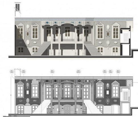
Figure 5(Left): Traditional house of Daroghe, Mashhad, Figure 6(Right): Elevations of Traditional house of Daroghe