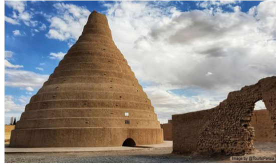
Figure 3(Left): Traditional Twin refrigerator in Sirjan, Kerman Figure 4(Right): Traditional refrigerator in Abarkooh, Yazd

mutually related to the structure and nature of the research. Therefore, to create a foundation of integrity in this research, a qualitative method has been used throughout the research process. In order to achieve the desired results in this article and provide appropriate answers to the above questions, a library research method including books, theses, and articles has been used. And finally, an attempt has been made to analyze the data obtained through field observation and present conclusions.