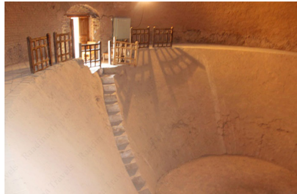
Figure 9: Icehouse of Karimabad, Mashhad Figure 10: Inside of Icehouse of Karimabad