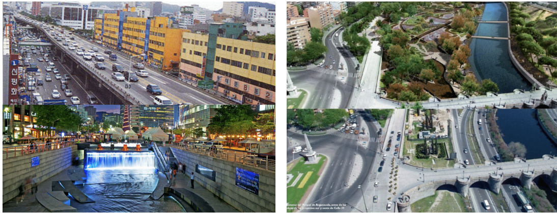
Figure 1: Right image: Rio Madrid Urban Regeneration Project, 2010 Left image: Cheonggyecheon Project, SeoAhn South Korea, 2005