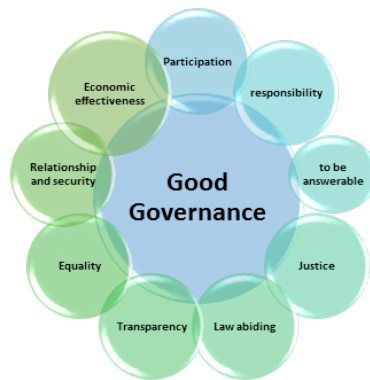
Fig 1: Main characteristics of good governance

In this research, based on the eight indicators of the United Nations Development Program and the World Bank and their development by studying the theoretical and experimental literature of the research, finally the following main characteristics have been extracted. Important criteria are: