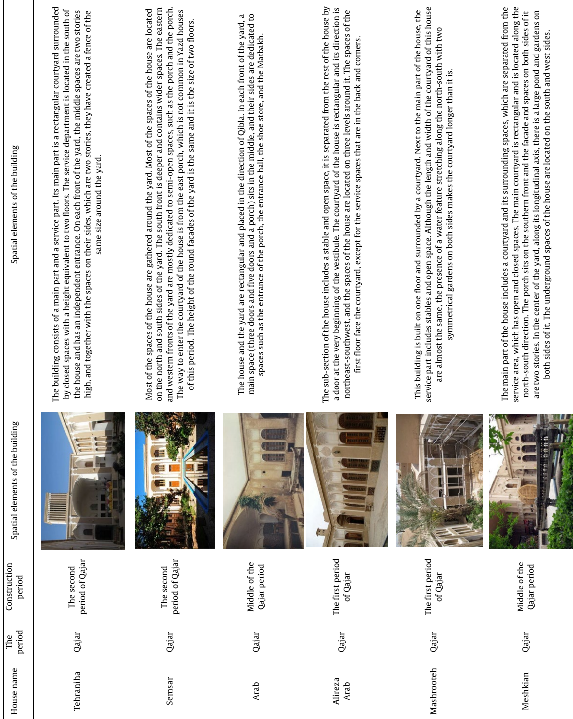
Table 6: Typology of selected houses of the Qajar period in Yazd city