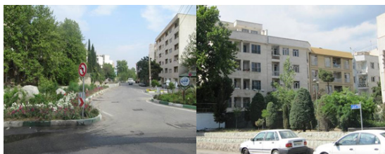
Fig. 3: a sample of open green space in texture

These open green spaces in residential fine-textured prevent noise resulted from traffic in major or minor courses in such a way that the comportment of these natural organic buffers are clearly apparent in fine texture near main streets (Fig.3).