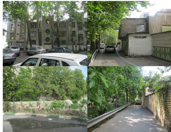
Fig. 4: samples of texture walls (edge) (in different arenas)

In conditions of urban edges importance played by these walls in texture, they maintain their initial state which is deduced from local architecture and Urbanism or change to other types of qualities due to newer construction (Fig.4).